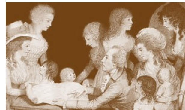
THE EDGEWORTH FAMILY